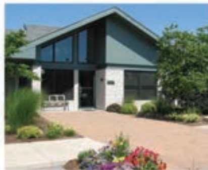
Benet House Retreat Center

The new St. Mary Monastery and Benet House Retreat Center, opened in 2003, were built according to the Rule of Benedict, incorporating such values as community, hospitality and good stewardship. A full schedule of spiritual retreats and programs is offered throughout the year. Spiritual direction is also available.