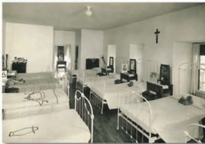
The girls' dorm in the old Mary Hall of St. Mary's Academy, circa 1940.