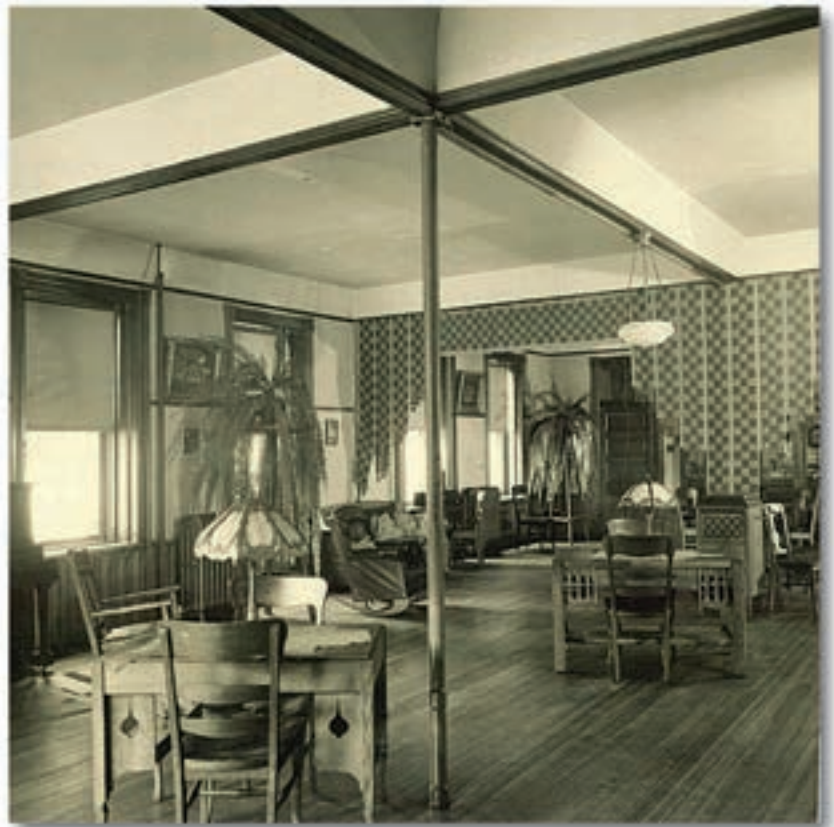
St. Mary's Academy library, 1942

The Sisters had a profound influence on me and my four brothers and sister. They taught us religion and later educated both of us girls in High School. They provided a wonderful future for us that, along with the faith and strength of our parents, allowed us to honor God's plan for us.