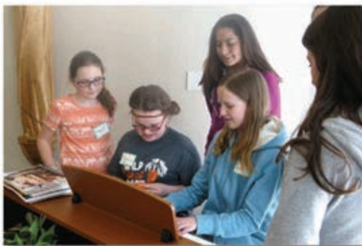
Area middle school students play piano during the "Be a Catholic Sister for a Day" retreat at St. Mary Monastery earlier this year.