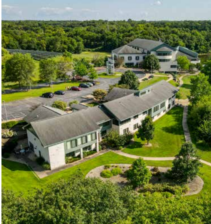
Benet House Retreat Center